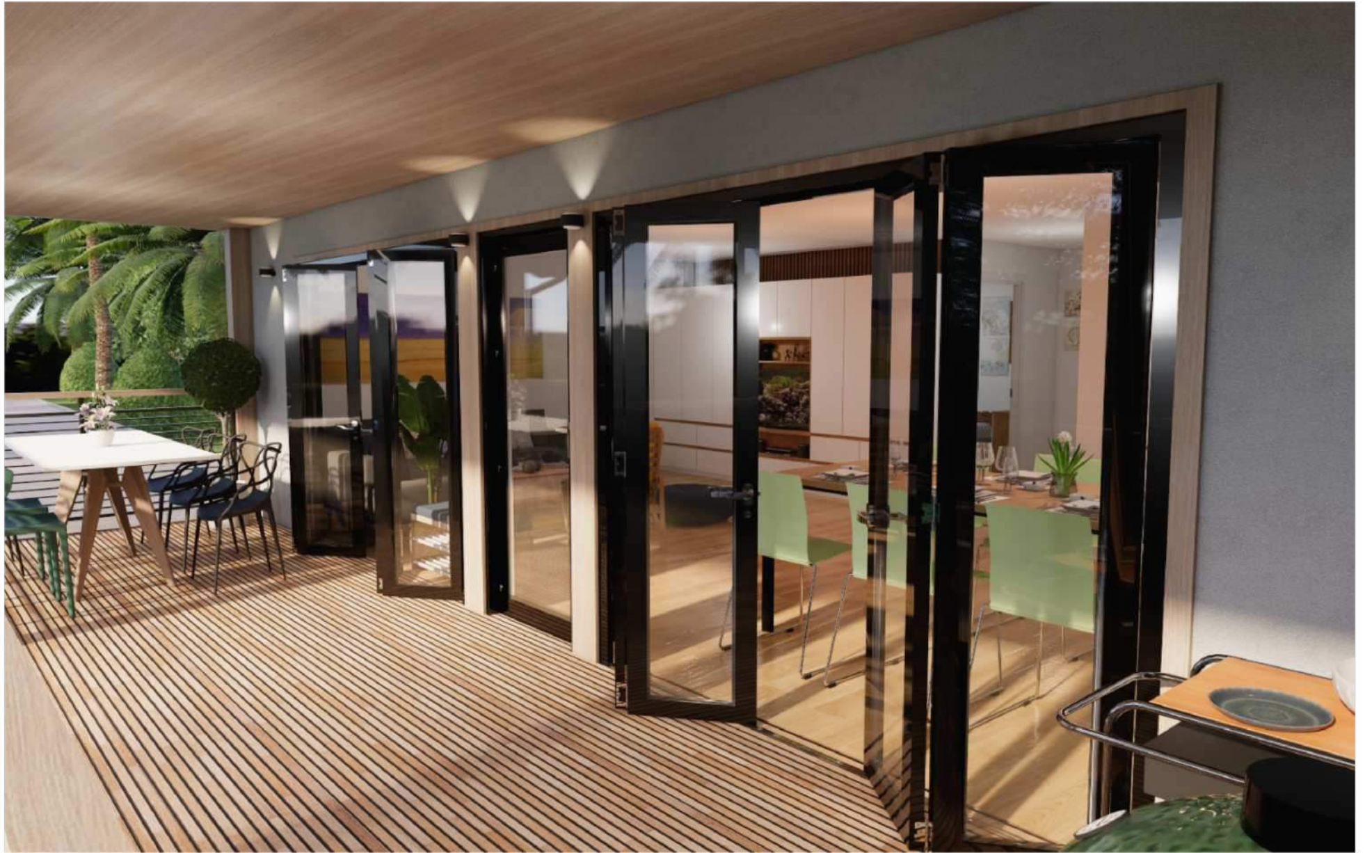
Topeka Deluxe 100m2 with accordion doors leading to the covered terrace