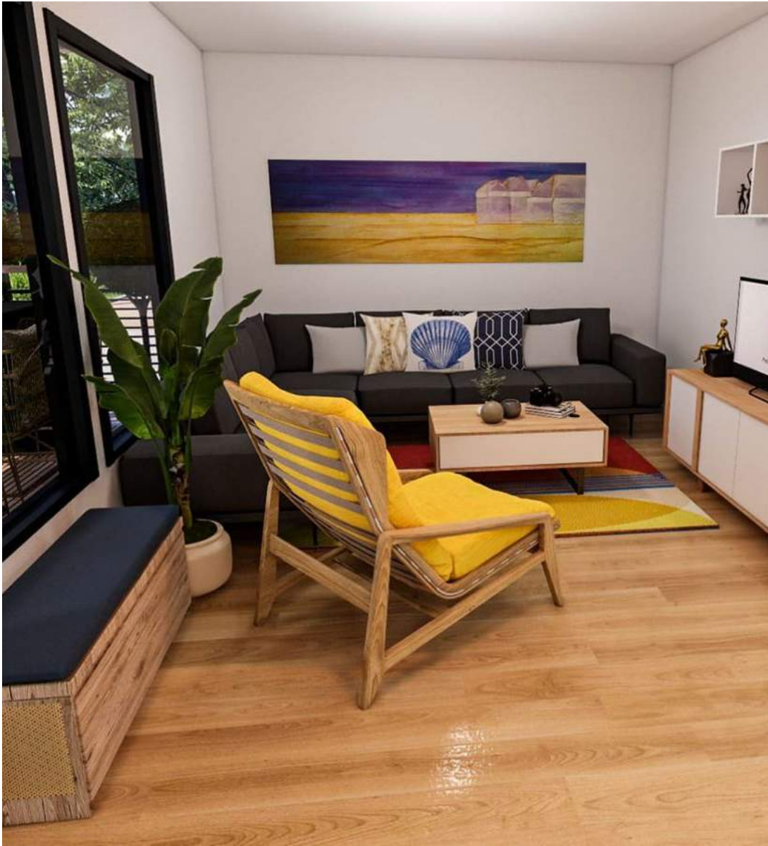
Impression of Prefab Home Topeka