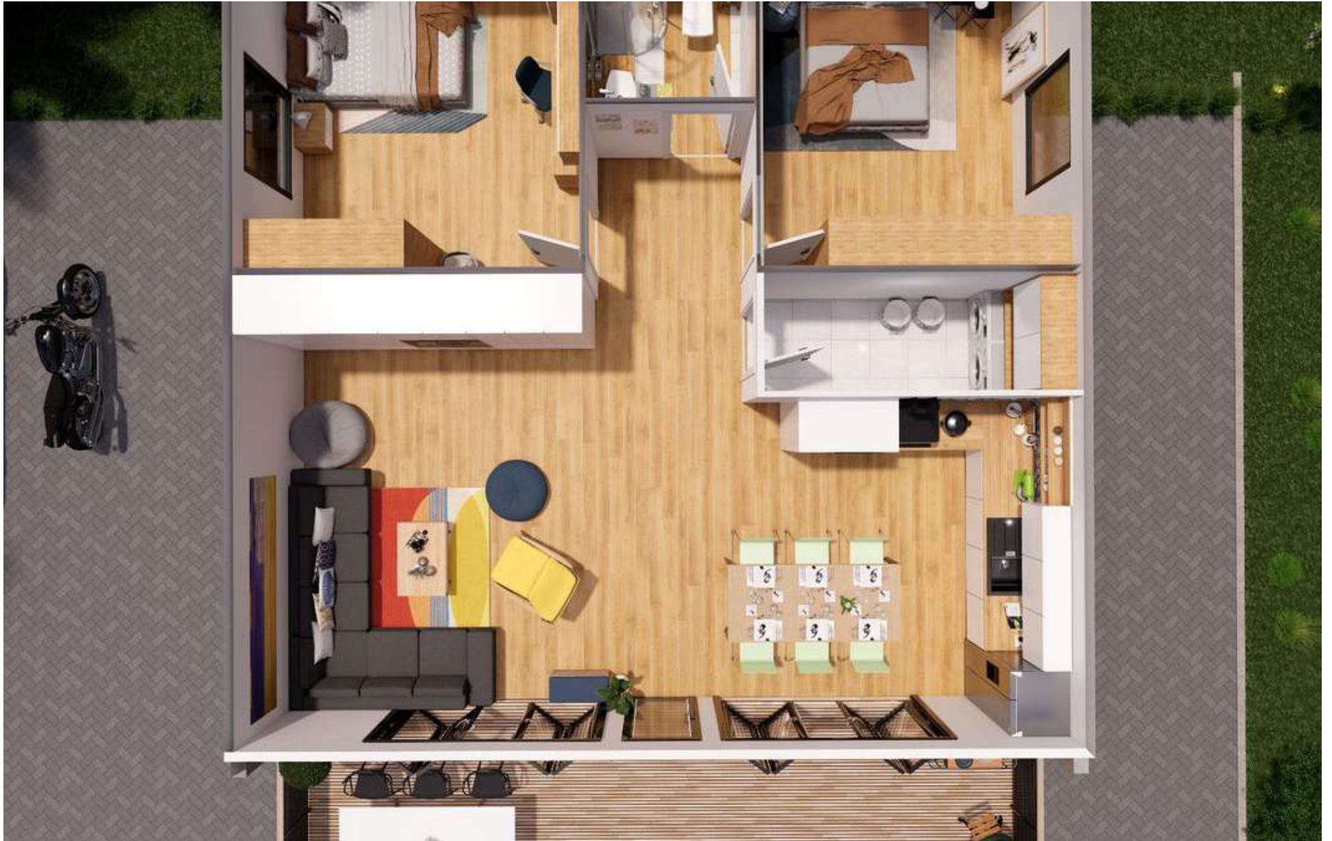
Floor plan of Topeka Deluxe

Interior living space of 77m 2 (excluding 23m 2 terrace)