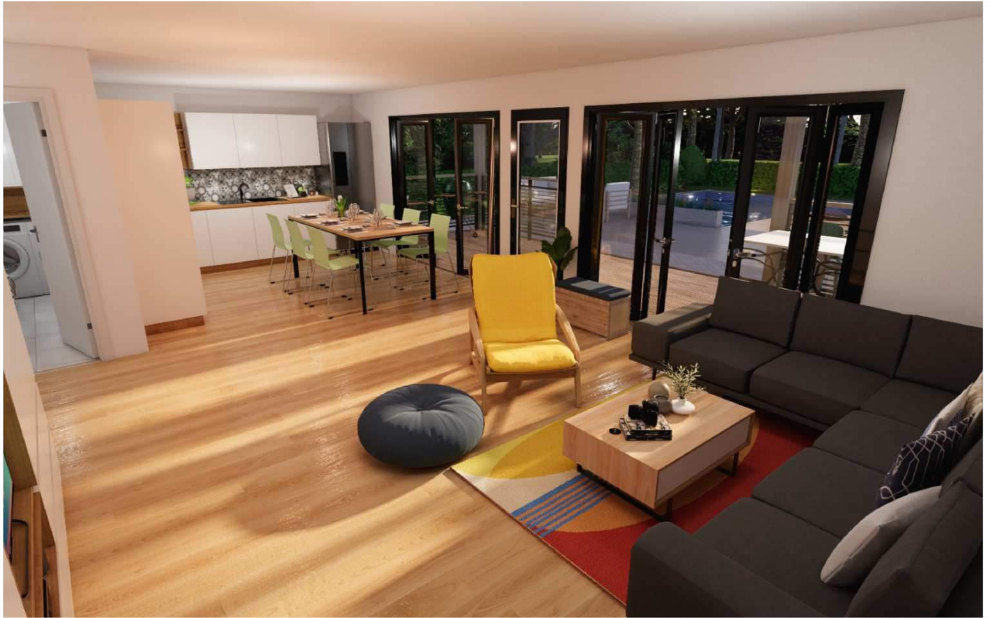
Topeka Deluxe with luxury kitchen, additional storage, or second bathroom