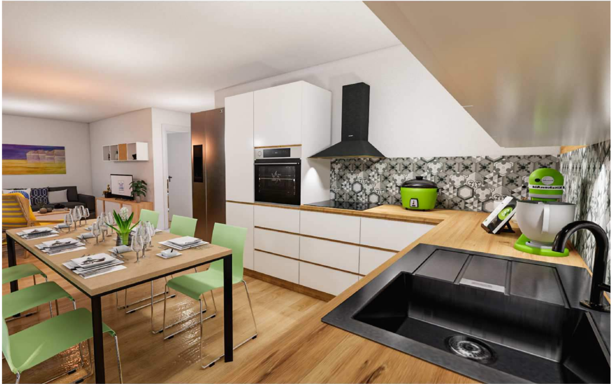
Topeka Deluxe with a luxury kitchen and a larger living space