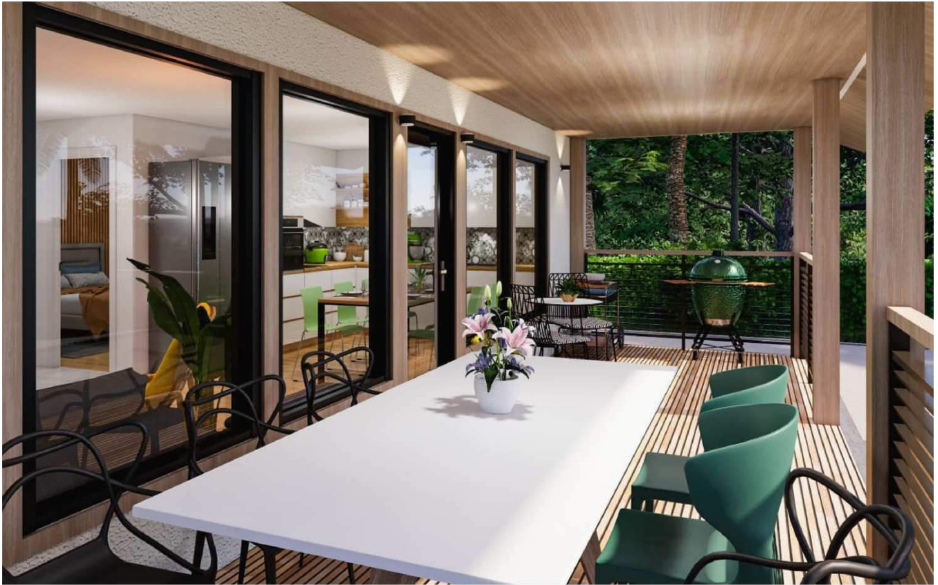
Impression of the terrace