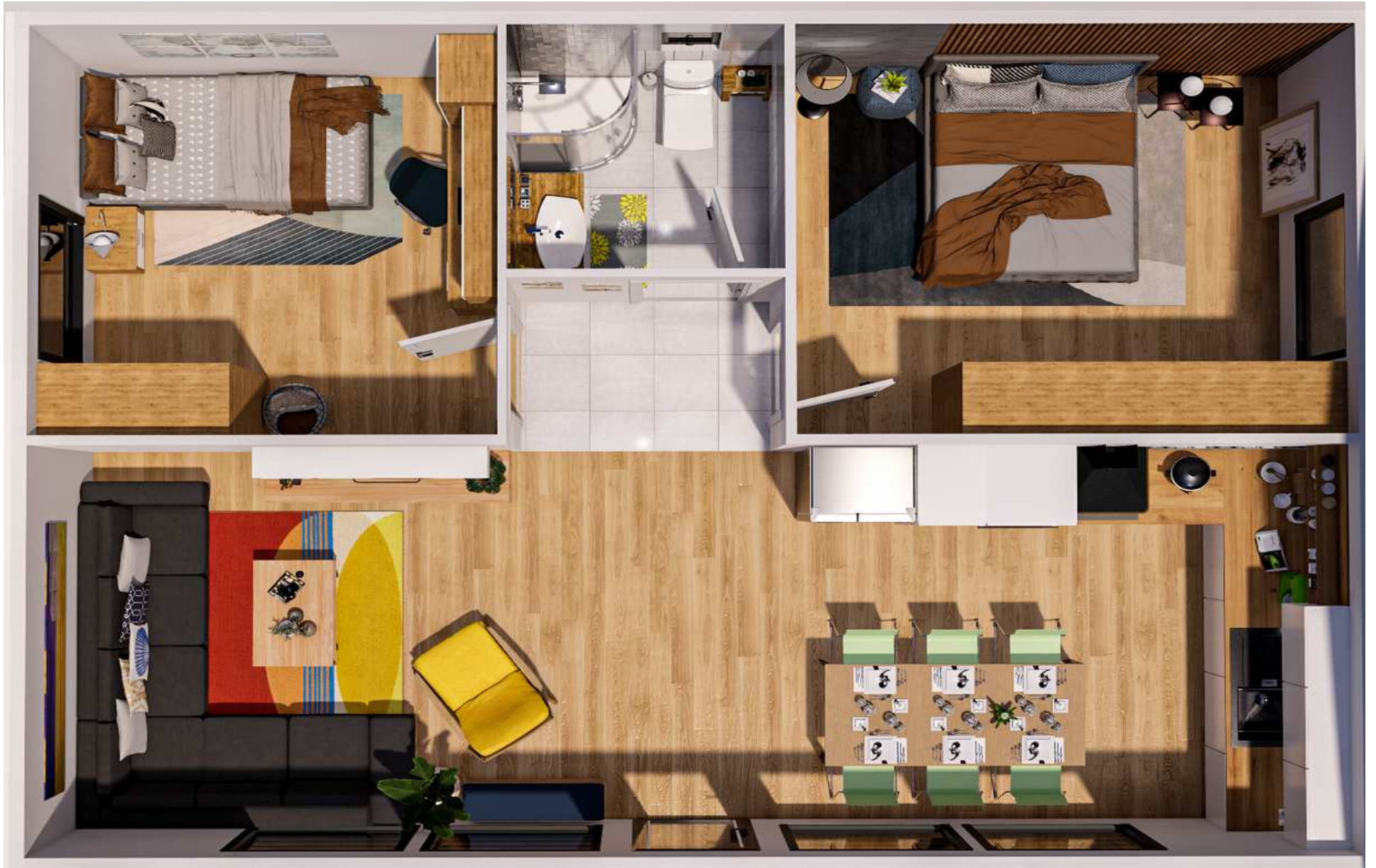
Floor plan of Topeka